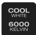
6000K & Cool White

The NIGHT BREAKER LED family - OSRAM's first street-legal1) LED retrofit lamps.