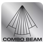
Combo Beam Combined beam of light