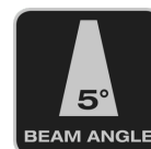
Beam angle 5° Exceptionally focused beam angle