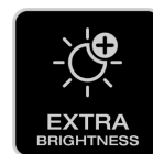
Extra Brightness 2)

Vibration resistant, environmentally friendly, and cost-efficient