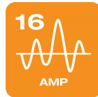
Connects to any 16A (3 phase) charging unit or station with a type 2 connection.

Charge at home and on the move Type 2 to Type 2 PIN | 3PHASE