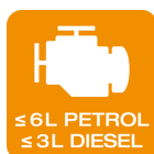
≤ 6L PETROL ≤ 3L DIESEL

New Boost function allows user to restart vehicles with depleted batteries