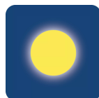
Amber when ON

Thanks to cutting edge interference and absorber coating